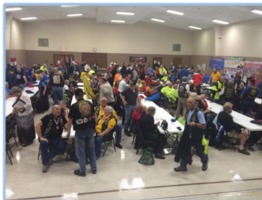
It was a full house in the Grand Hall.