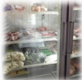
Easy to pick out and ready to pick up!

I can attest to the fact that they have some of the best Cod I've ever eaten, and I'm not even a fish person! Of course, you can't go wrong with the beef ribeye, (which is probably my favorite) and it's tenderness. Cooked just right, it melts in your mouth! The shrimp is huge (even better when wrapped in bacon - but what isn't?) Stop in!